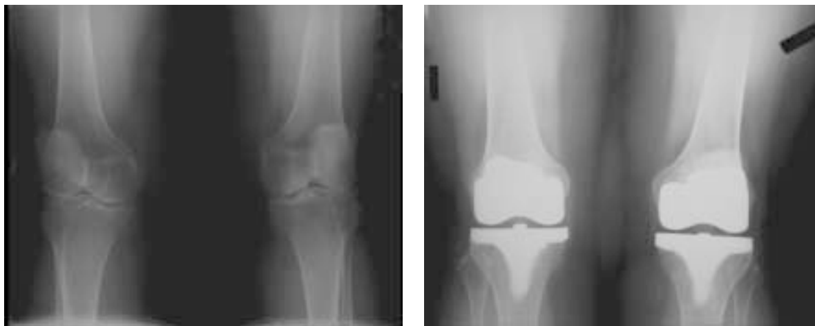
Figures 2A and 2B Pre-operative and 2-years post-operative radiographs of patient receiving simultaneous, bilateral total knee arthroplasty using the MJS total knee arthroplasty system.

Radiographic evaluation at the most recent follow-up for all patients across both groups revealed well fixed and aligned components without evidence of component-cement or cement-bone interface debonding. All cement interfaces were uniform, complete, and without evidence of fracture (Figures 2A & 2B).