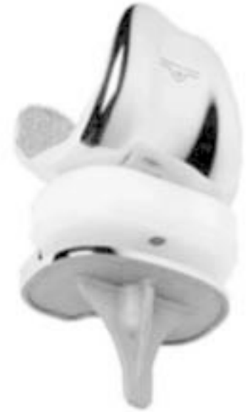
Figure 1 Image of the posterior cruciate ligament (PCL) sparing, MJS Total Knee System, Osteoimplant Technology, Inc. Baltimore, MD

\pm 9.3^\circ , range: 90^\circ to 125^\circ ). The average pre-operative total range-of-motion (ROM) was 100.4^\circ (standard deviation: \pm 14.3^\circ , range: 70^\circ to 125^\circ ). Pre-operative radiographic review revealed 66 (74%) of the knees in varus (average 7.2^\circ , standard deviation \pm 2.5^\circ , range: 4^\circ to 12^\circ ), 16 (18%) knees in valgus (average 13.3^\circ , standard deviation \pm 6.0^\circ , range: 5^\circ to 20^\circ ), and 7 (8%) knees in neutral. The pre-operative HSS score was 58.0 (standard deviation: \pm 10.1 , range: 36 to 82) and there was no statistical difference in HSS score based on gender ( p = 0.140 ).