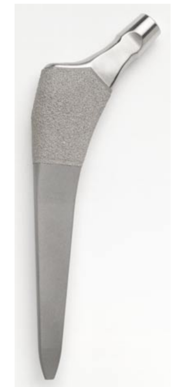
Monoblock style Tapered Stem